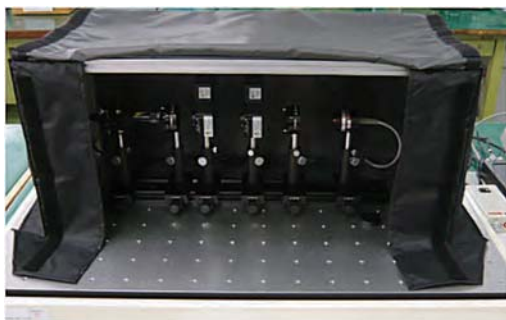
Polarizing film transmission polarization ratio measuring system

For customer's requirements, we can provide customized products and also design newly.