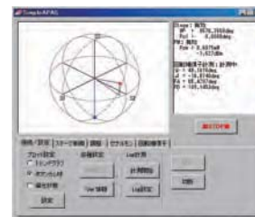
Poincare sphere display