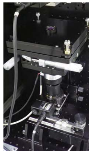
Circularly polarized light measuring system