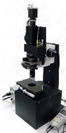
Coaxial observation system with phase difference measuring system